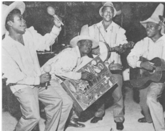
Jamaicans love music, and none more so than their native calypso. You'll hear it everywhere.

For complete information, fill in the coupon and return to the Tour Chairman today. A limited number of hotel rooms have been reserved, so please act promptly.