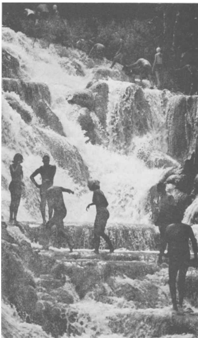
Picturesque Dunn's River Falls, near Ocho Rios, rises 600 feet from the sea and a white sand beach to the surrounding mountains.

For those who would like to join the fun but cannot stay the full six days, a "long weekend" version of the tour can be arranged. Persons choosing the shorter tour will return to Miami mid-day on Monday, April 8. The cost is $260 per person.